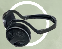
WS AUDIO headphones