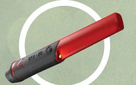
Pinpointer MI-6 connected