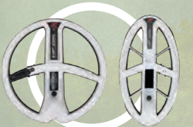
HF Coils 15 - 30 - 50 or 80 kHz + shifts