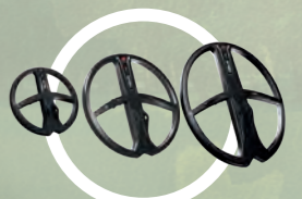
X35 Coils 4 - 8 - 12 - 18 - 25 kHz + shifts