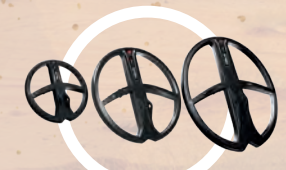
X35 Coils 4 - 8 - 12 - 18 - 25 kHz + shifts