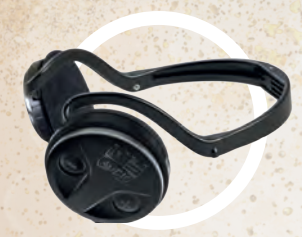
WS AUDIO headphones