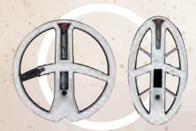
HF Coils 22cm / 9" HF COIL : 15 / 28 / 54 kHz + shift Elliptical HF COIL : 15 / 28 / 80 kHz + shift