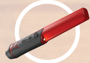
Pinpointer MI-6 connected